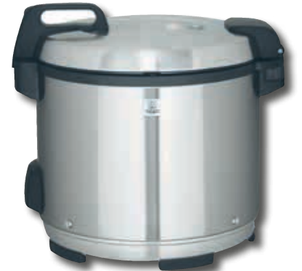
JNO-A36U 20 cups