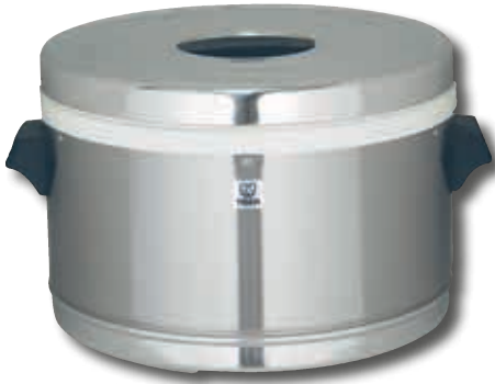
JFM-390P 22 cups JFM-570P 32 cups