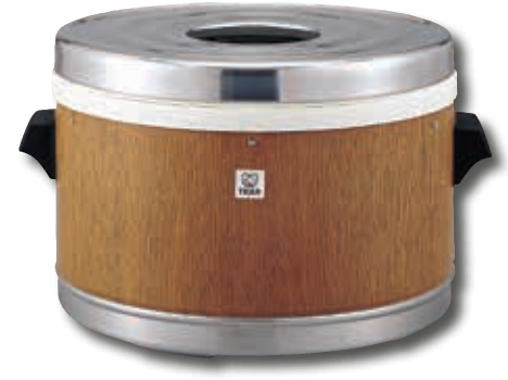
JFM-5700 32 cups