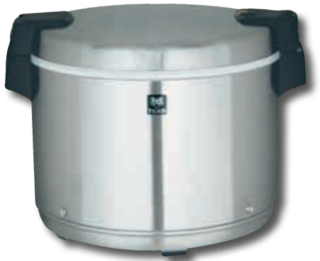
JHC-72UA 40 cups JHC-90UA 50 cups